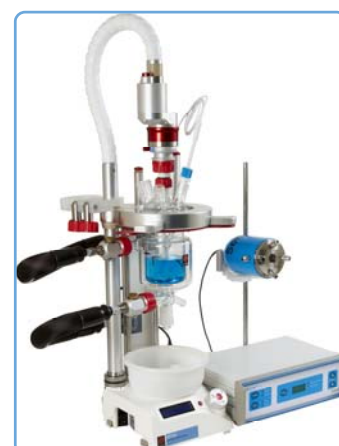
Right: Atlas SonoLab System